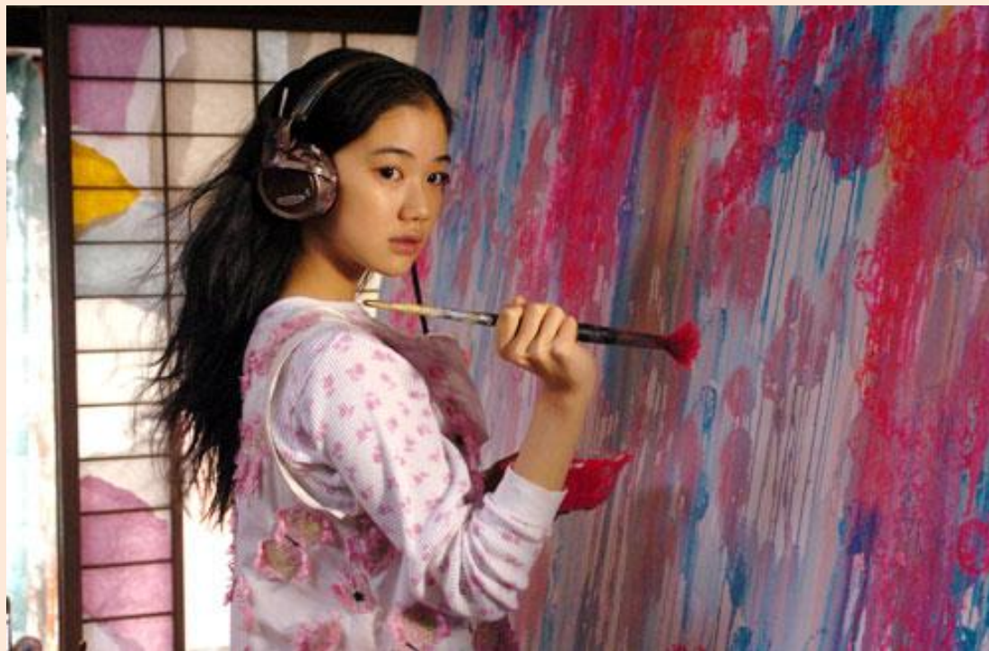
Honey and Clover (Masahiro Takada, 2006)

10-11 May 2010, Leeds Humanities Research Institute, 29-31 Clarendon Place, University of Leeds – Registrations now open!